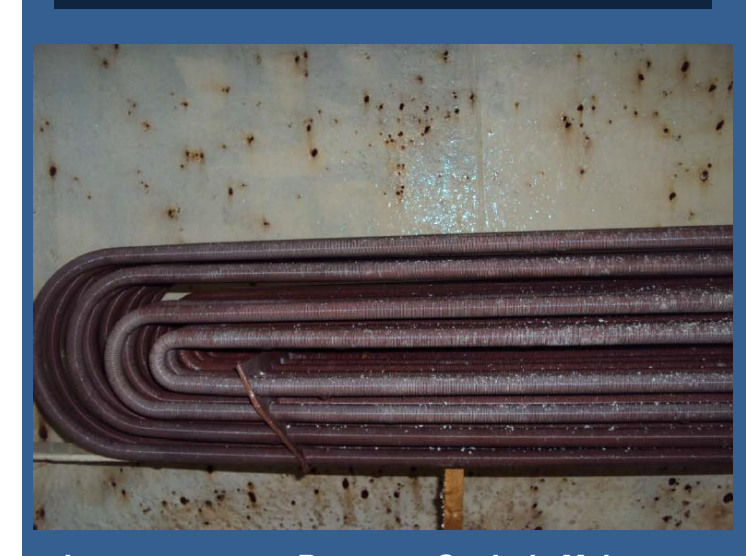
Click here to see full report.

FILTERSORB® SP3 Treated Water shows significant improvement in the Heat Exchanging system