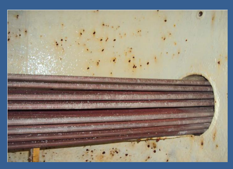
After 8 months of use

Fouling, scale and corrosion in the heat exchangers and pipes are causing heavy costs for cleaning and sometimes even replacements of the equipments. Using FILTERSORB® SP3 the cleaning costs are more than 80% less and mostly the lifetime of the equipments increases significantly. ...continues on Page 1