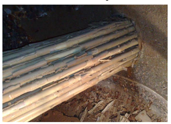
Before using FILTERSOBR® SP3

FILTERSORB® SP3 is may be the best solutions for heat exchangers in the oil field industry where hydrocarbons are either heated or cooled. Even on very critical heat exchanging applications FILTERSORB® SP3 has shown great results.